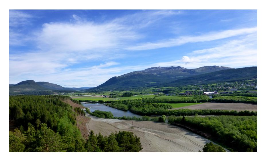
To the left:

Mt.Tron and the village of Alvdal seen from the top of the local ski jump, on 07.06.2013, at 11:59 hrs. In the foreground is the river Folla and (to the right) the confluence with the river Glomma.