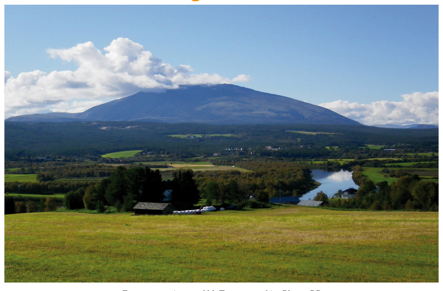
Front cover picture of Mt.Tron zoomed in.

After the submission of the Regulation Plan to the Municipality of Alvdal on July 1st this year, further adjustments to some details were suggested by the municipality's planning department. This, together with some unforeseen extra work prior to the submission, caused the plan to become substantially more expensive than originally planned and budgeted for. All possible adjustments of the plan after the political processing has started will, however, according to the consultant, be the responsibility of the municipality. After the plan has come up for its first processing at the Local Council it will be open for public hearing for six weeks when it will go to second processing.