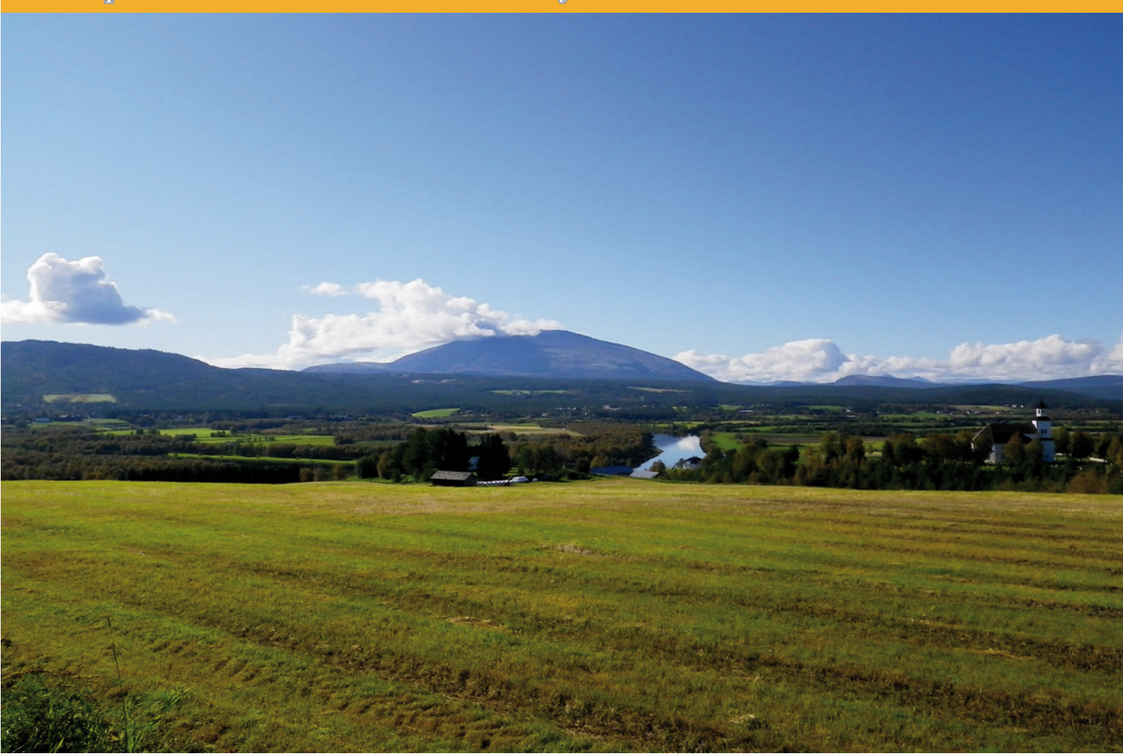
Mt. Tron seen from Tynset on a beautiful autumn day, September 10th 2011 at 10:25 hrs. Tynset Church is seen to the right.

September 2011 * Mt.Tron University of Peace Foundation * No. 3 Vol. 14