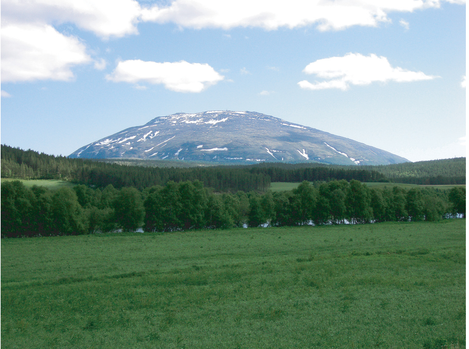
Mt. Tron seen from Tynset, with Glåma in the foreground, 18th June 2007. Photo: BP.

July 2007 • Mt. Tron University of Peace Foundation • No. 2 Vol. 10