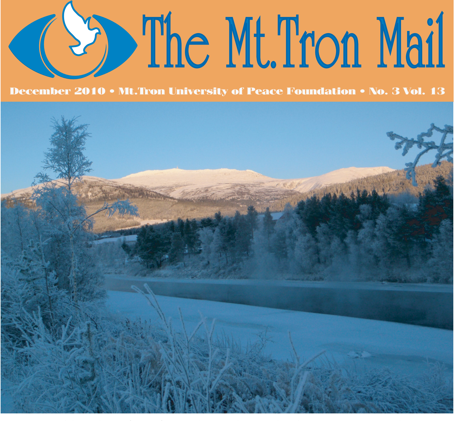
Mt. Tron\ with\ the\ river\ Glomma\ in\ front, seen\ from\ Steimosletta\ at.\ 1406\ hrs\ on\ November\ 30th\ 2010, temperature\ minus\ 27\ ^\circ\ C.\ Photo:\ BP.